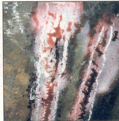
Upper left: Corrosion grooving apparent beneath pressure tap. Upper right: Stainless steel strip lining applied over integral stainless steel cladding.